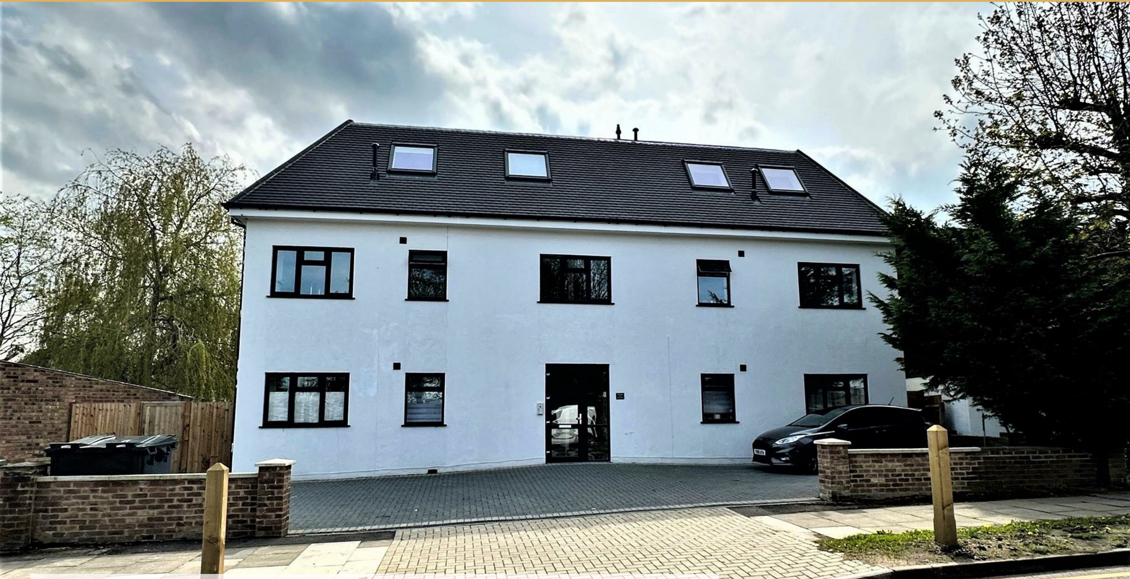
Flat 5 Villa May Lakeswood Road, Petts Wood, Kent, BR5 1BJ